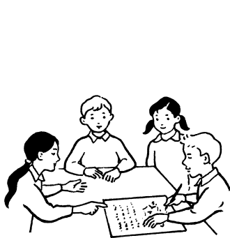
Talking and planning together

Why not show your welcome pack to people at home or visitors to the school? Ask them if it tells them all the things they want to know.