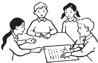
Talking and planning together

When the children return from the world of the 'school of nightmares', they travel to a world where there is nothing. It is a world ready to be developed. There are all sorts of things to do to create a new world, but it is your job to create a place for learning.