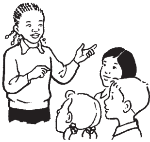
Listening to each other

How would someone know about your class and the people in it? It is your class challenge to create a guide to help anybody who doesn't know your class find out about it. This guide should be useful for visiting parents and adults as well as being something that will help a person who is new to your class.