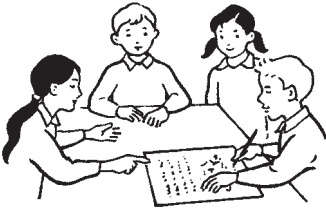
Talking and planning together